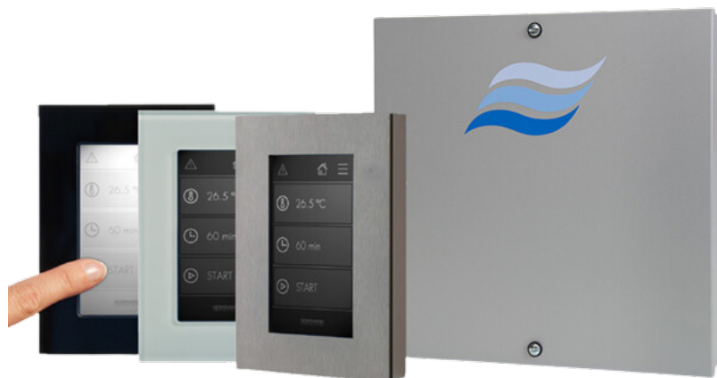
The external display in three versions

Additionally, energy saving cabins can be kept in a keep warm mode during standby operation, so they only heat up to setpoint when a guest is using the cabin.