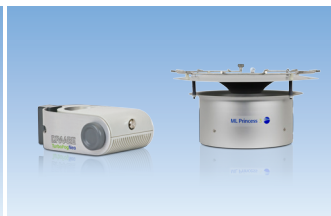
DR-Series Direct Room humidification