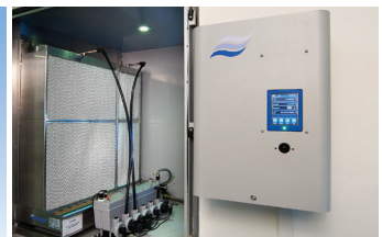
ME-Series Media Evaporative cooling & humidification

Condair manufactures a comprehensive range of humidifier and evaporative cooling systems across all humidification technologies. Whether for manufacturing or storage facilities, Condair's humidification engineers are able to provide the right solution to meet the needs of every environment.