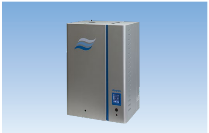
Nortec GS-Series Gas-fired steam humidification