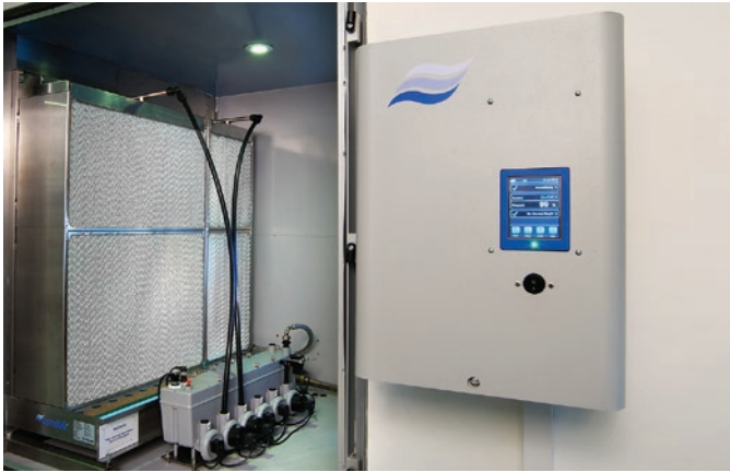
JS-Series Compressed air and water spray humidification